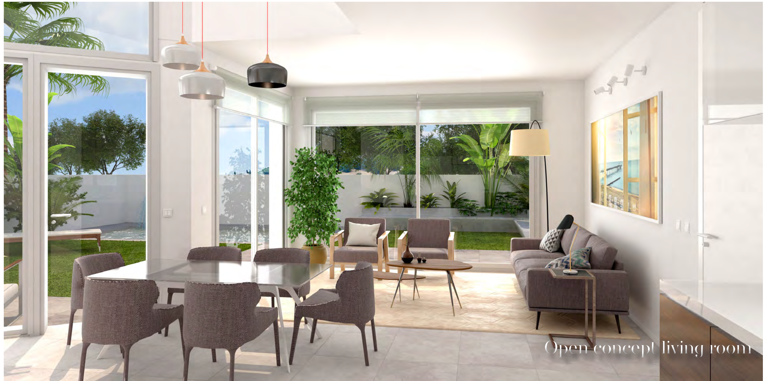
Open concept living room